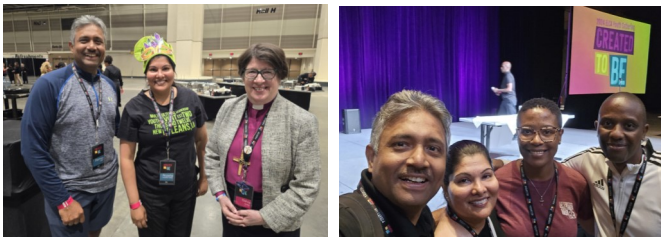
National Youth Gathering in New Orleans, LA

Throughout the warmer months of July and August, we participated in many ventures to extend the kingdom of God in this part of the vineyard and we have captured some moments. It is my hope that you embrace the opportunity to serve and make a difference in this season of change. Amen